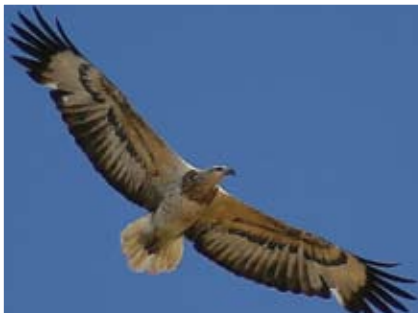
Juvenile White-bellied Sea-Eagle