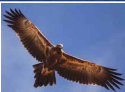
Juvenile Wedge-Tailed Eagle