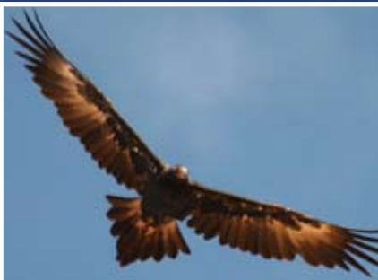
Adult Wedge-Tailed Eagle