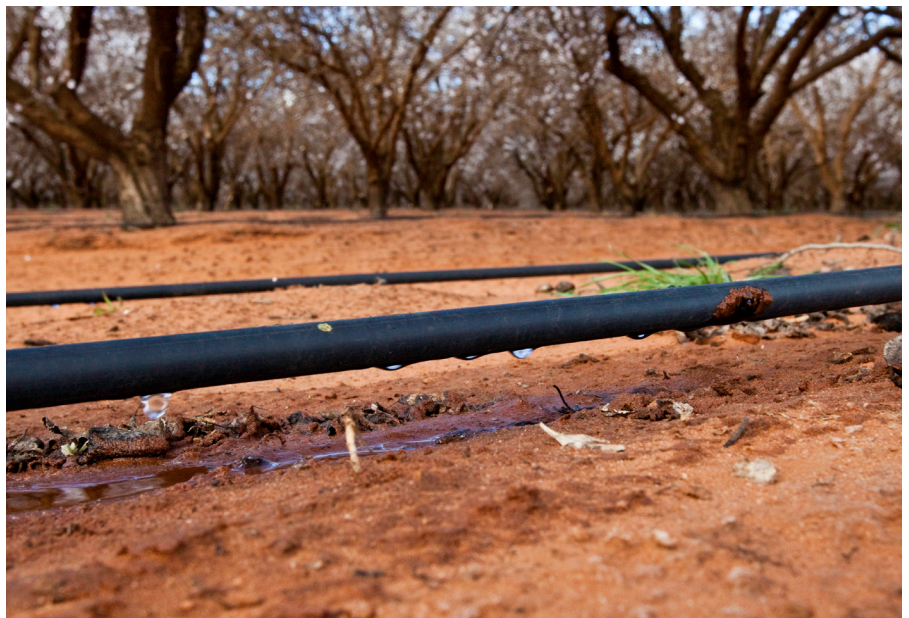
Above: Almonds being irrigated by modern dripper irrigation systems.

Additionally, with drought and low water allocations it is imperative for growers not to waste water by irrigating at the right time and for the right length of time.